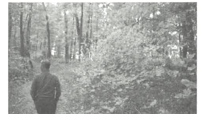
Many people own land because it gives them a place to relax and unwind.

Active management, or stewardship, of the vegetation on your land allows you to make it more productive and enticing for wildlife and more efficient at purifying air and water. Management can increase the value of the land and provide landowners with opportunities to exercise and find new hobbies such as bird