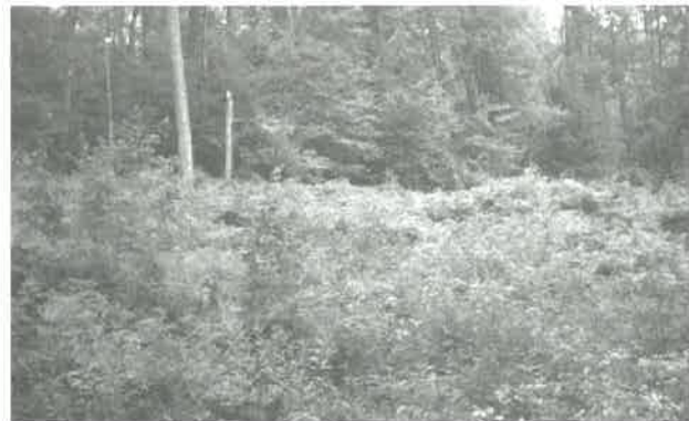
Creating forest openings or early successional habitat may increase the varieties of wildlife you will see on your land.

Once you've decided on your objectives for your land and on active management of your forest, the next step is to develop a stewardship plan. The process of developing a plan will help you understand how your objectives are, or aren't, compatible. For example, you might want to harvest some trees for firewood. What if another member of your family wants to see more wildlife on the property? You can achieve both goals if you select firewood trees carefully. Cutting for firewood can improve the health of your land by opening up selected areas of the forest for more desirable trees to grow as well as making those areas more attractive for wildlife. Managing lands for wildlife usually means managing the vegetation that wildlife depend upon for food and shelter.